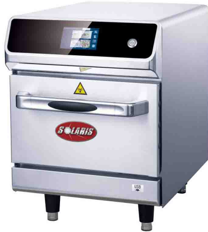
HSS-208 Model Shown