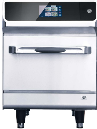
HSB-208 Model Shown