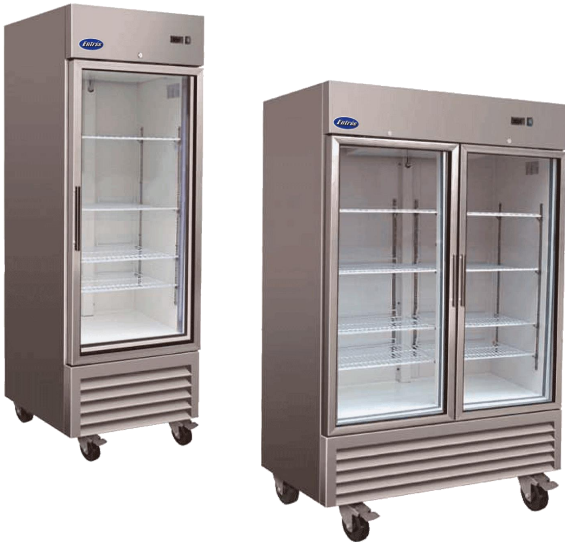
Above pictureS of CR1-27-G-HC & CR2-54-G-HC (R290)