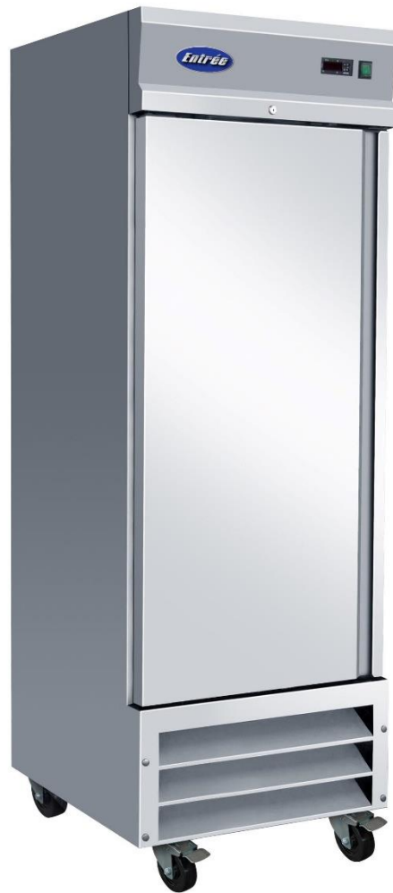
Above picture of CF1-19-HC (R290)